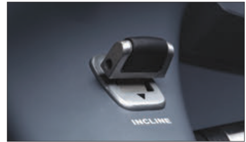
Quick shifter for fast-and-easy adjustments