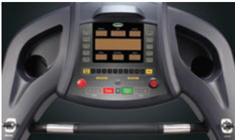
Intuitive, easy-to-use LED console