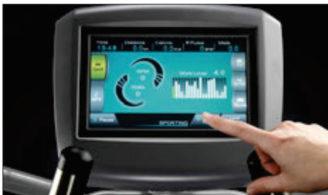
Intuitive, easy-to-use touch screen console