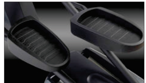
Heavy-duty, over-sized footplates