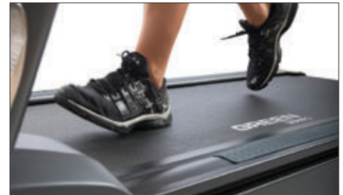
25,000 mile maintenance-free running belt