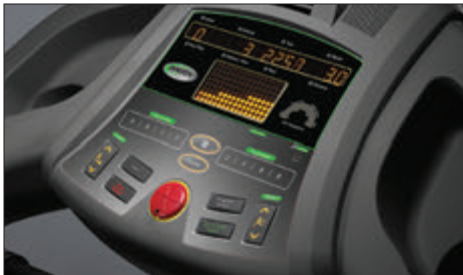
Intuitive, easy-to-use console